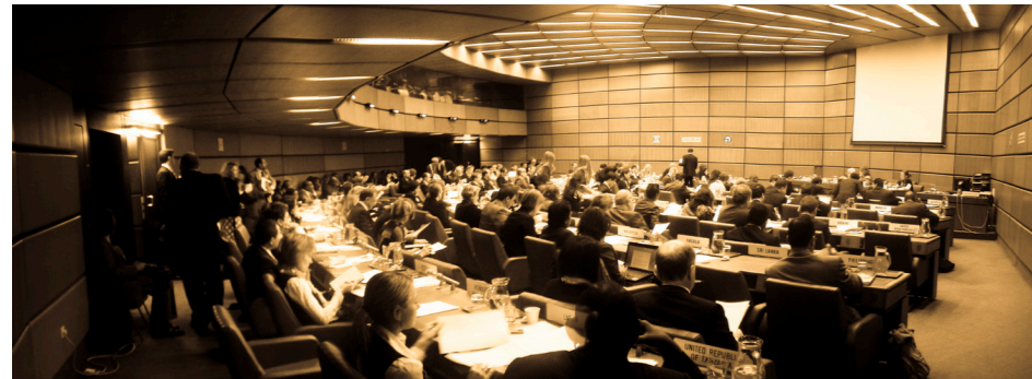
UN Commission on Narcotic Drugs