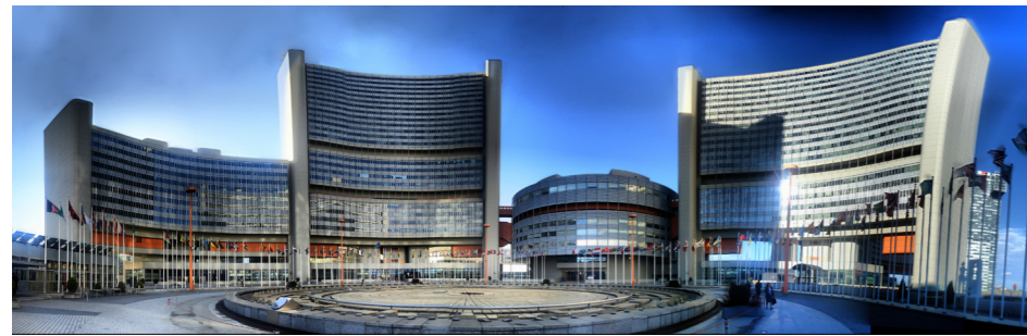
UN buildings, Vienna